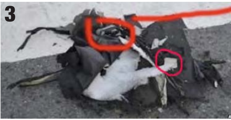
Continued next page